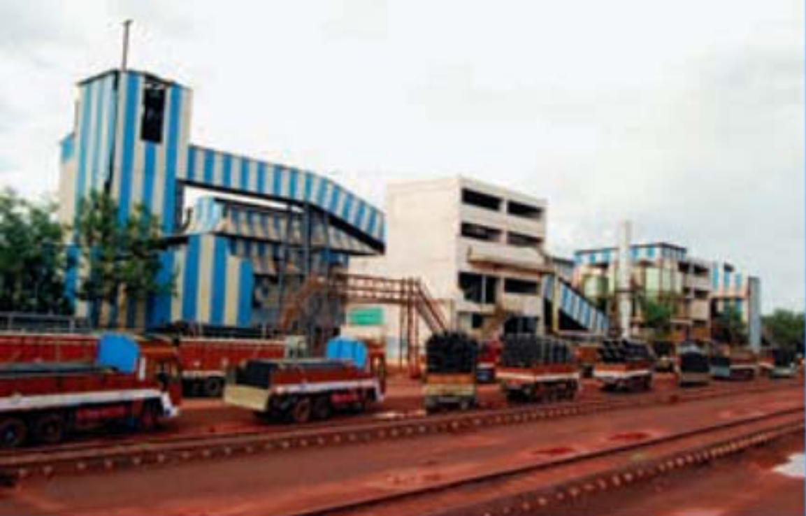
A view of the Sinter Plant

A section of the villagers at the medical camp organized by the company